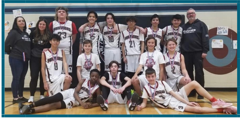
Our Pep Rally was held on March 3rd. Even the Panther made an appearance!