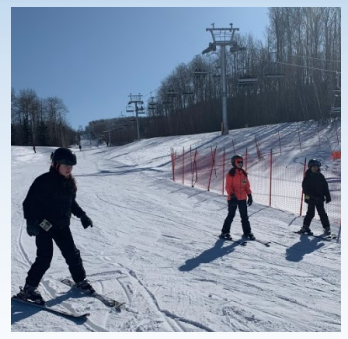
Our Grade 9's had an excellent adventure at Marmot Basin in Jasper.