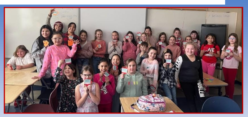
This class received suckers as a reward for the cleanest classroom. Awesome job! Our custodians sure appreciate you!